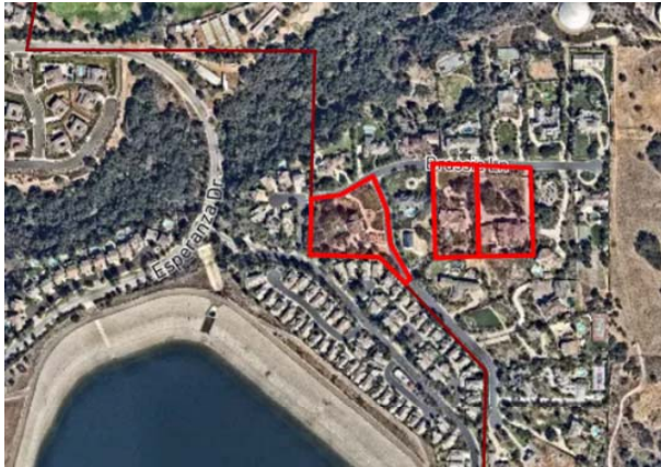
City of La Verne Out of Agency Agreement

Depending on the application involved, State Law requires that LAFCO notify various parties, such as landowners and registered voters, both within and adjacent to the affected territory. For this reason, you may receive multiple copies of this notice.